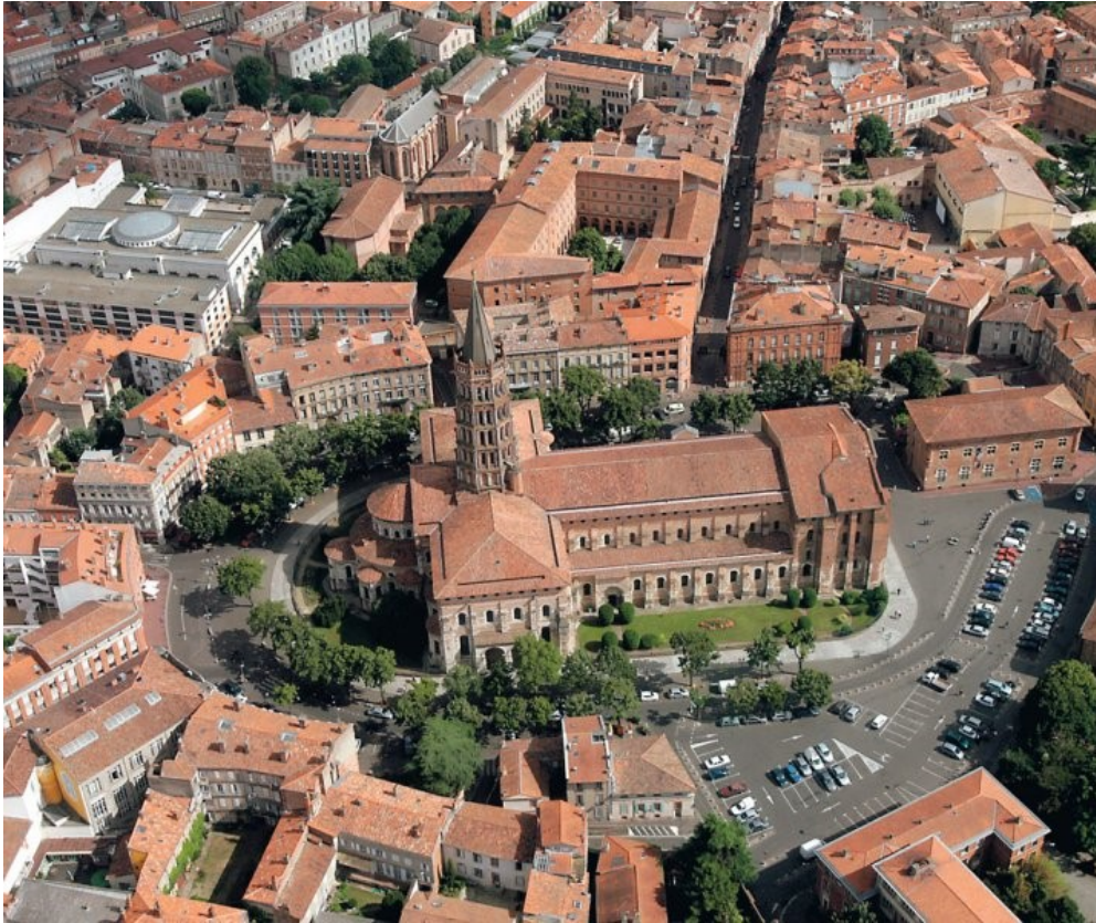
Toulouse, Saint Sernin basilic