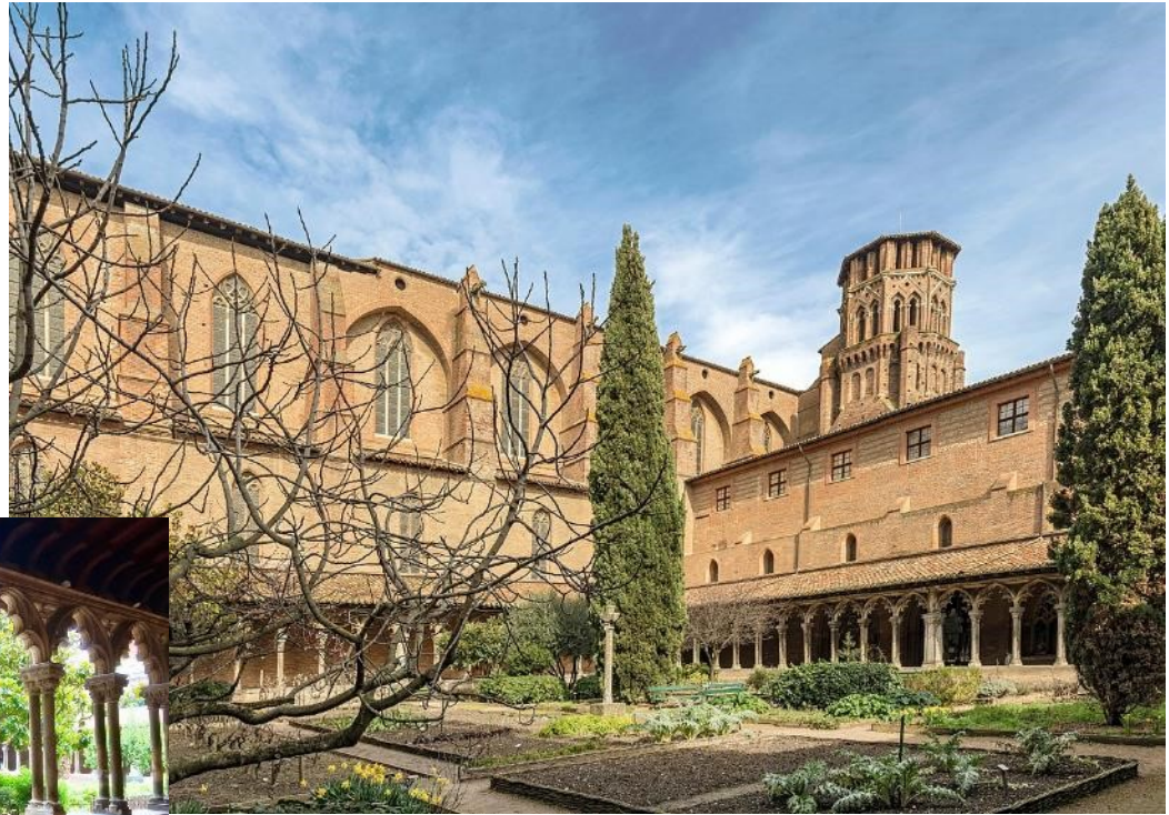
Toulouse, Saint Augustins cloyster and bell tower