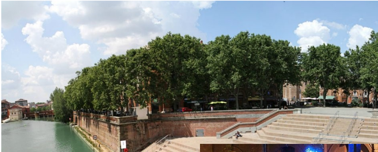
Toulouse, Saint Pierre square The Garonna