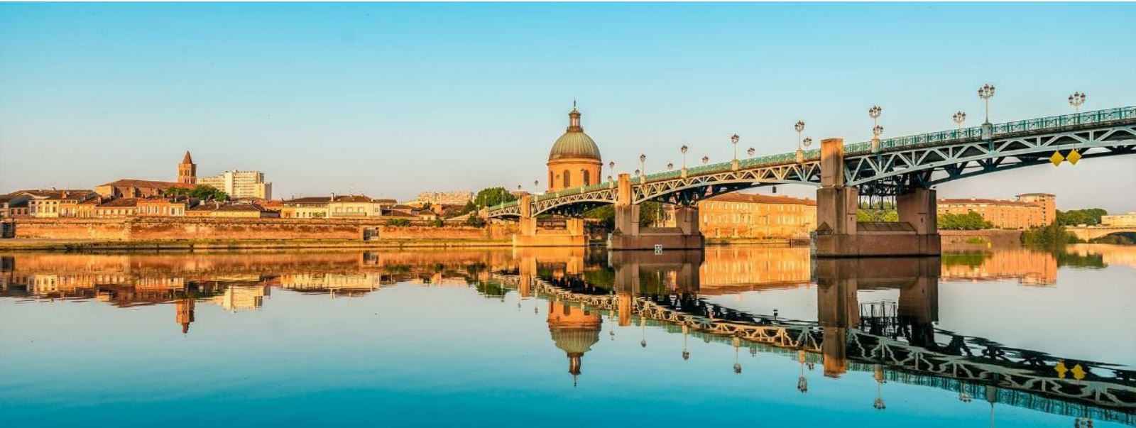
Toulouse, Garonna & Saint Pierre bridge