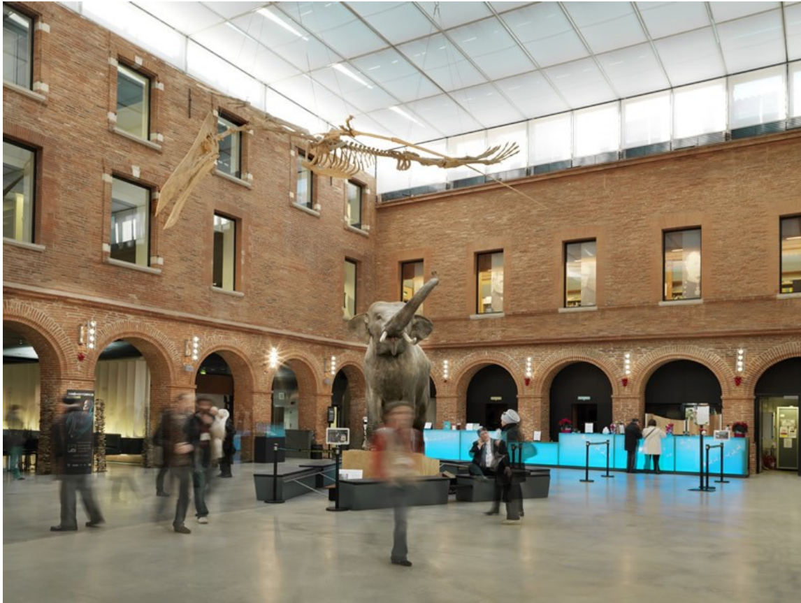
Toulouse, the natural history museum