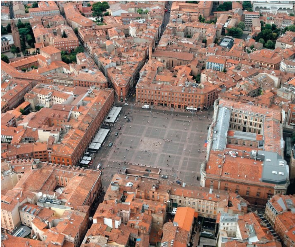
Toulouse, « Le Capitole », the city's central square