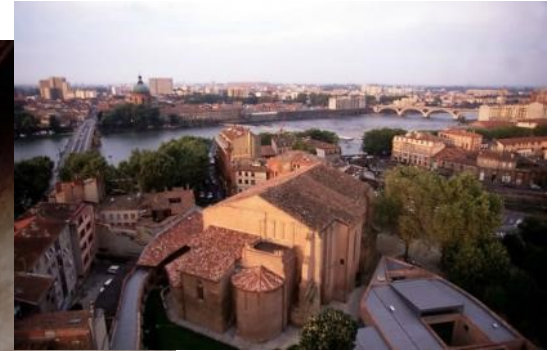
Toulouse, Saint Pierre des Cuisines auditorium