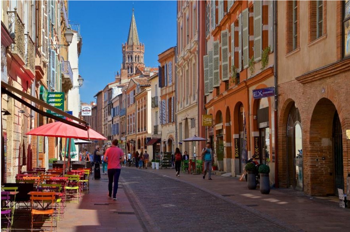
Toulouse, down town, a pedestrian street