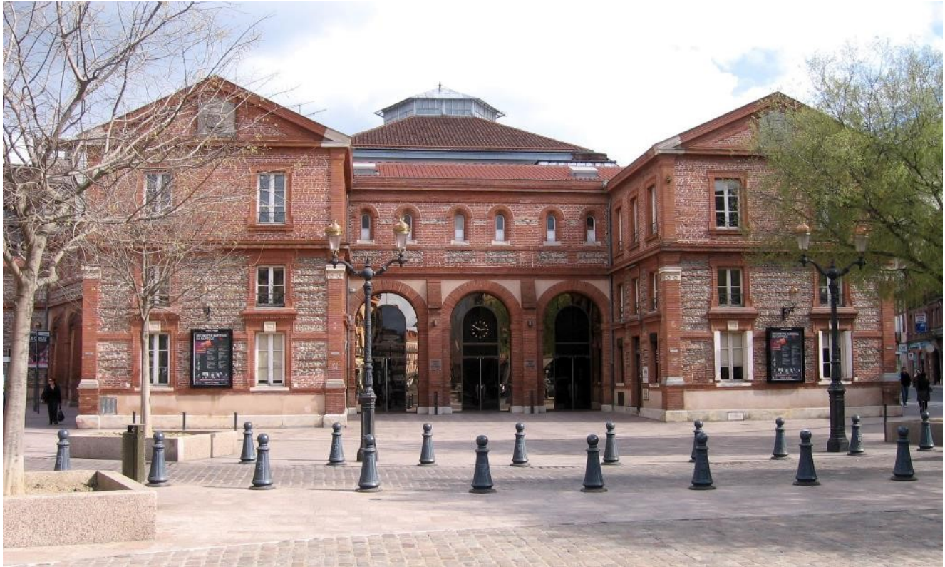
Toulouse, Halles aux Grains