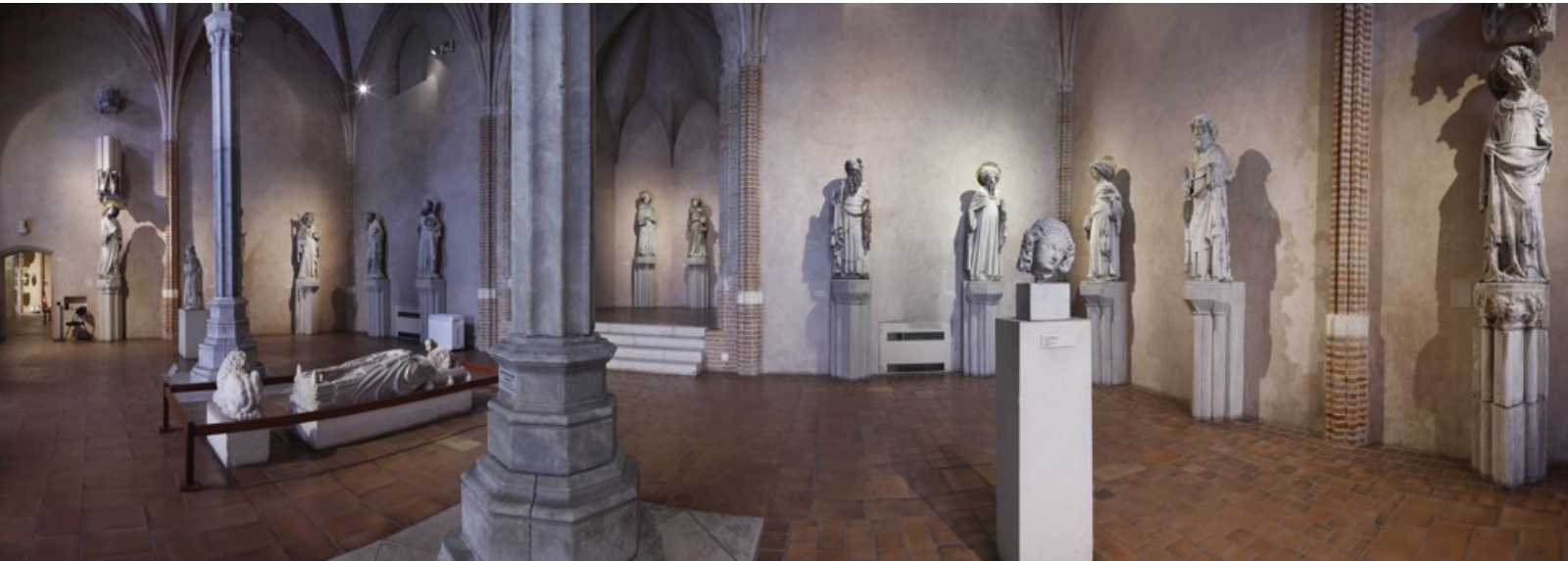
Toulouse, the Jacobin museum