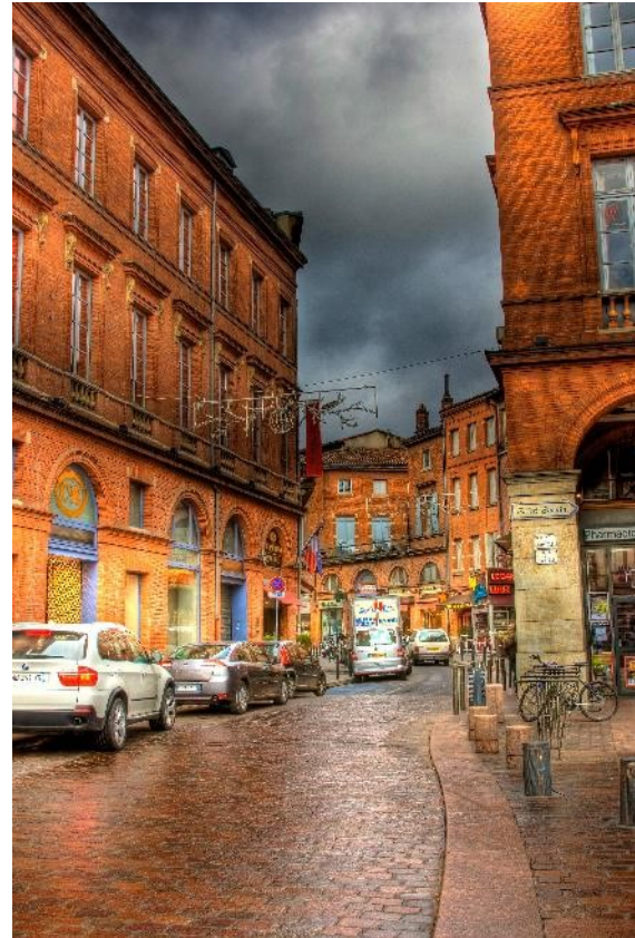
Toulouse, façades de briques rouges