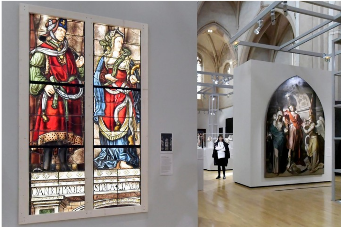
Toulouse, exposition aux Augustins