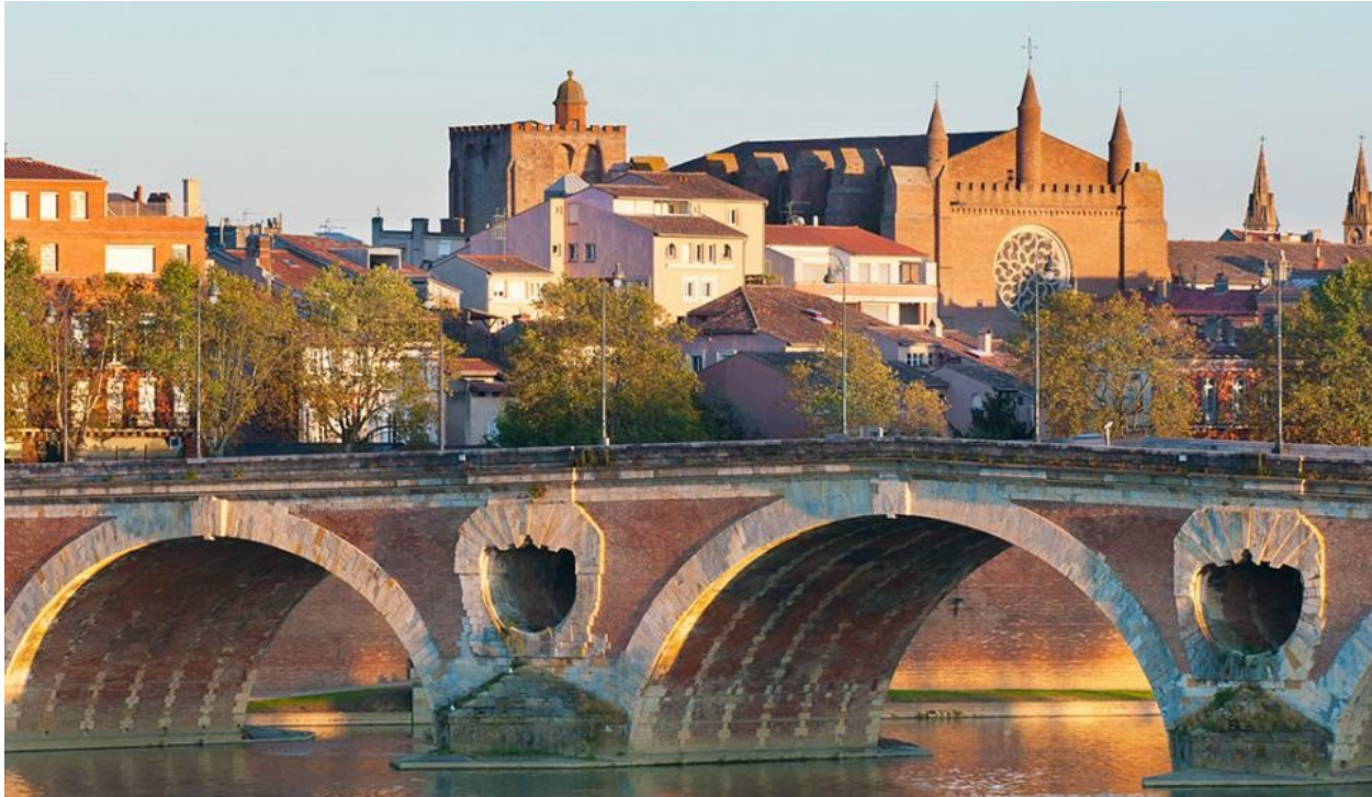
Toulouse, Pont Neuf & Saint Etienne Cathedral