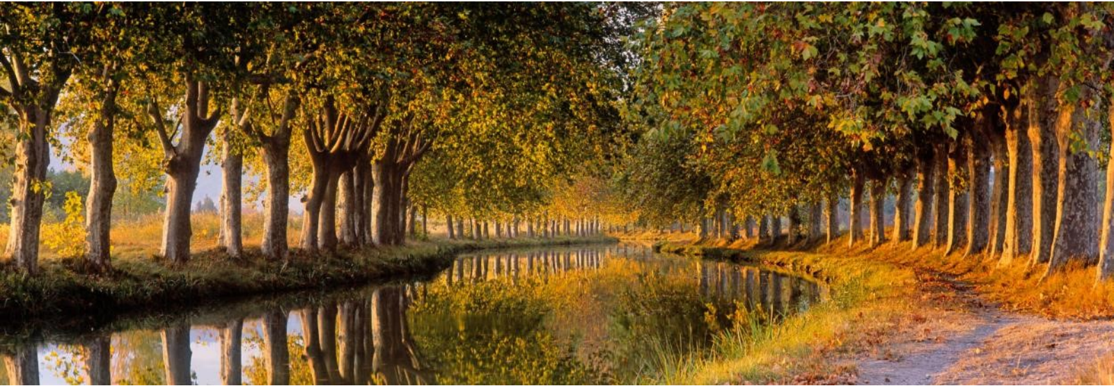
Toulouse, canal du Midi