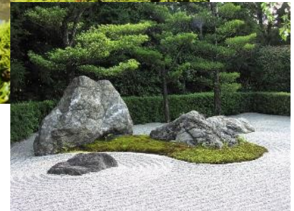
Toulouse, The Japanese garden