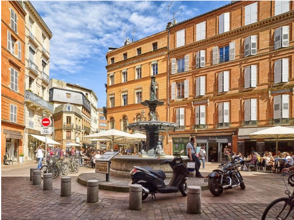
Toulouse, down town