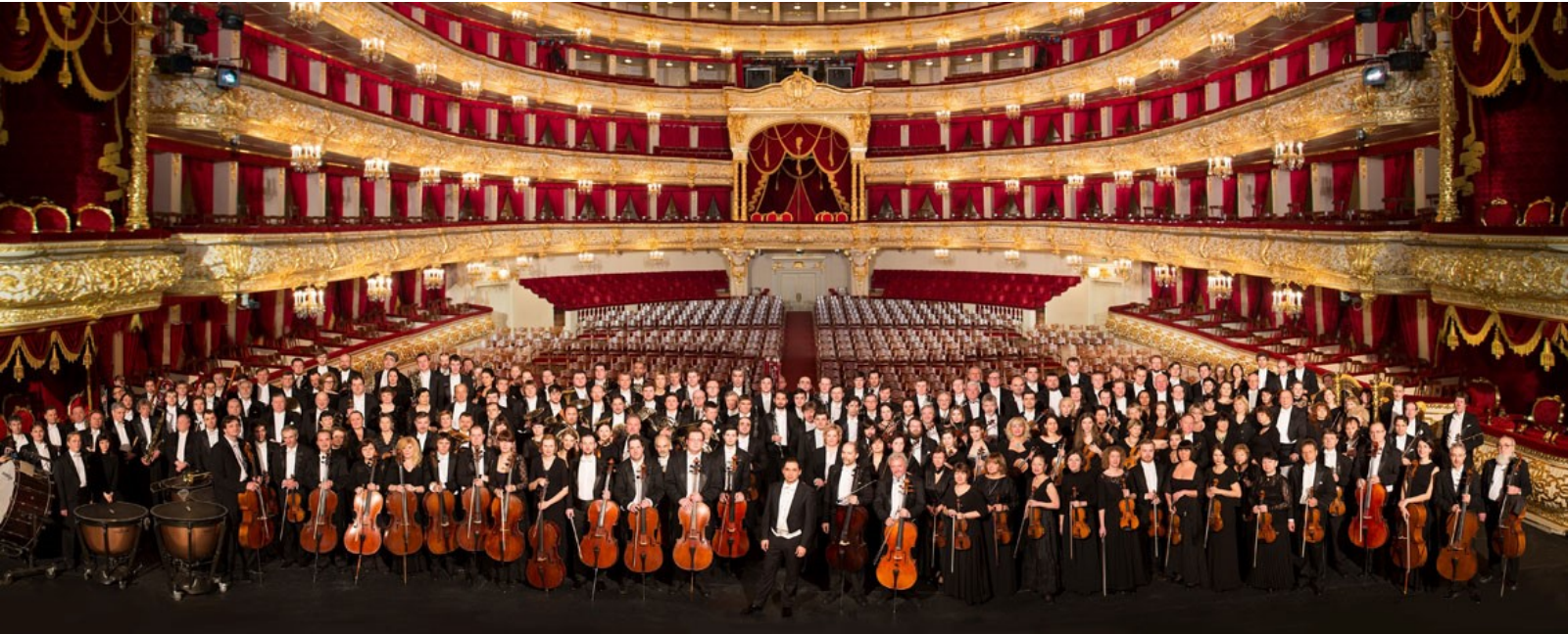
Toulouse, The Capitol Orchestra