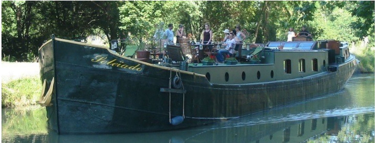
Toulouse, canal du Midi