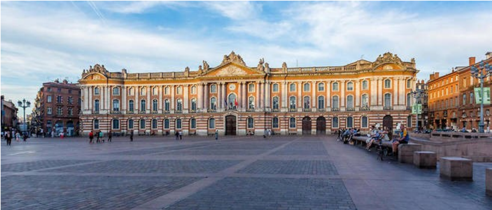
Toulouse, The Capitol