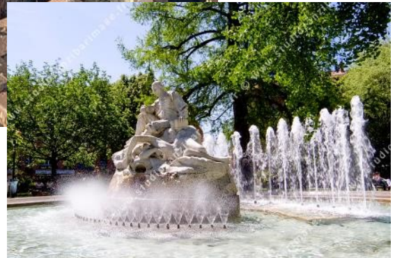
Toulouse, Wilson square