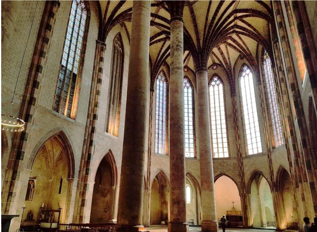
Toulouse, St Augustin former convent