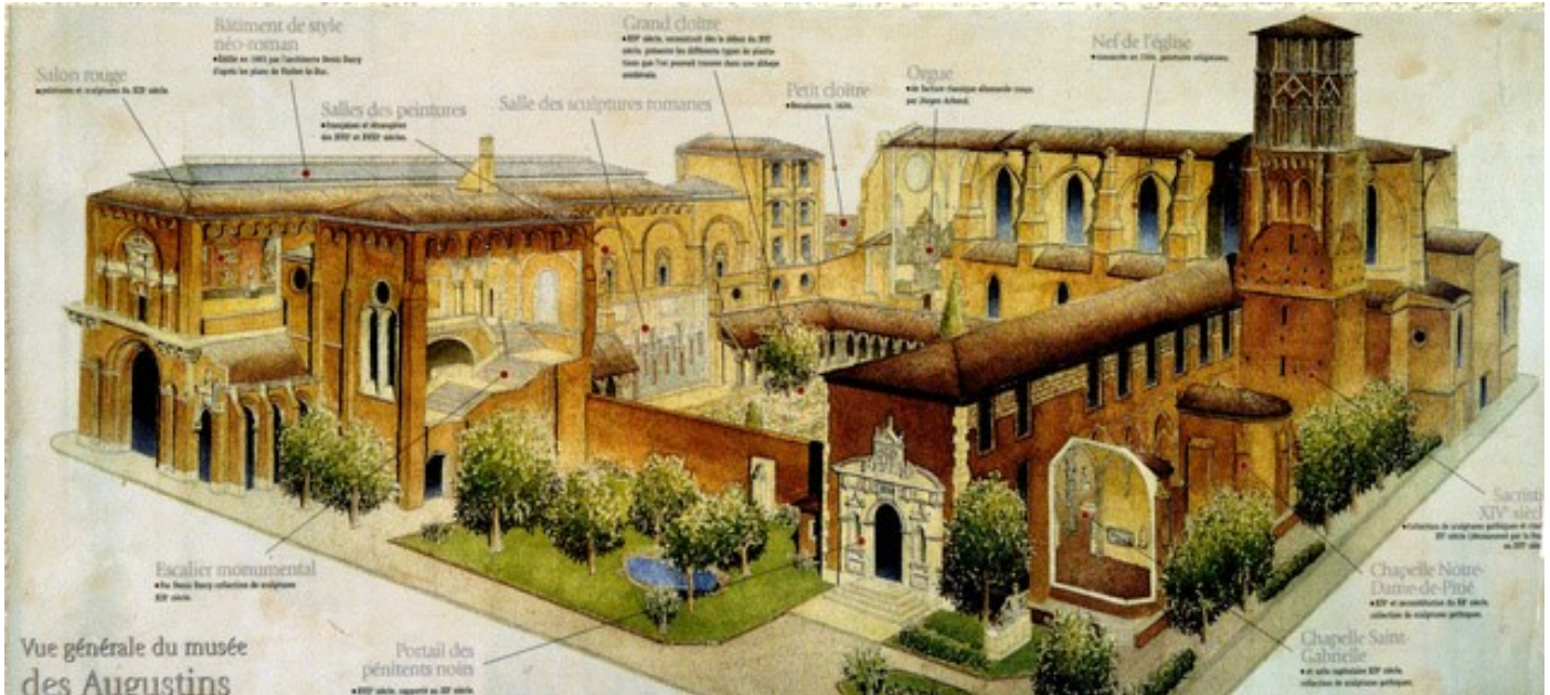
Toulouse, Augustin museum