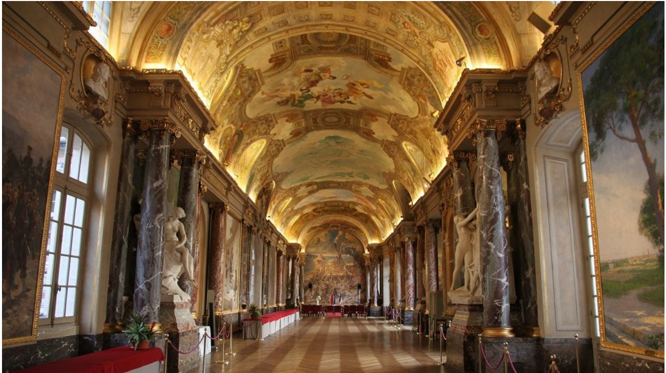
Toulouse, Capitol, salle des Illustres