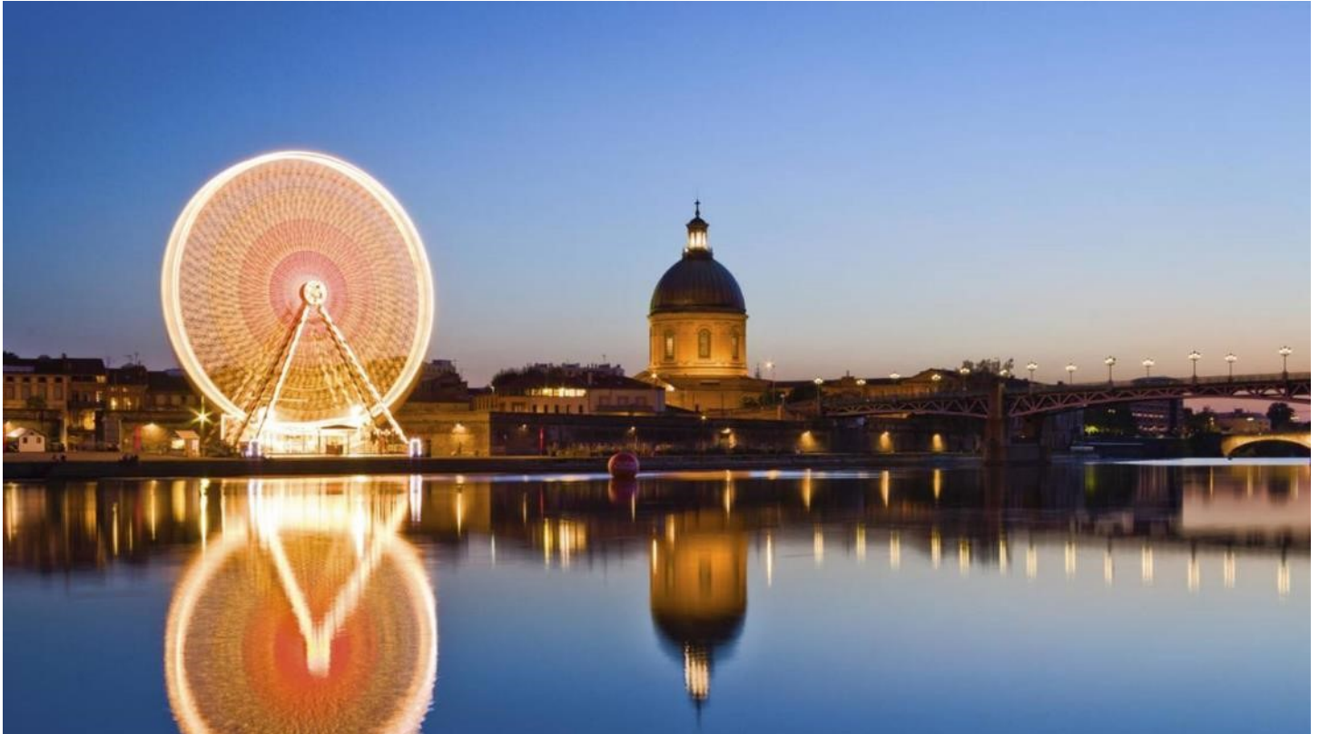
Toulouse, Garonna & Hôtel Dieu by night