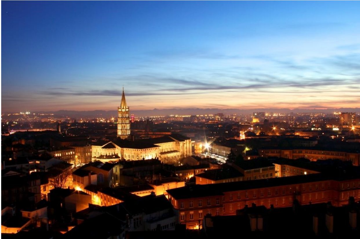
Toulouse, by night