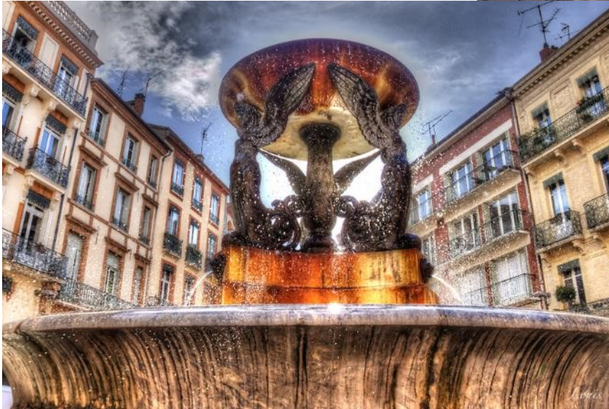
Toulouse, Trinity square fountain