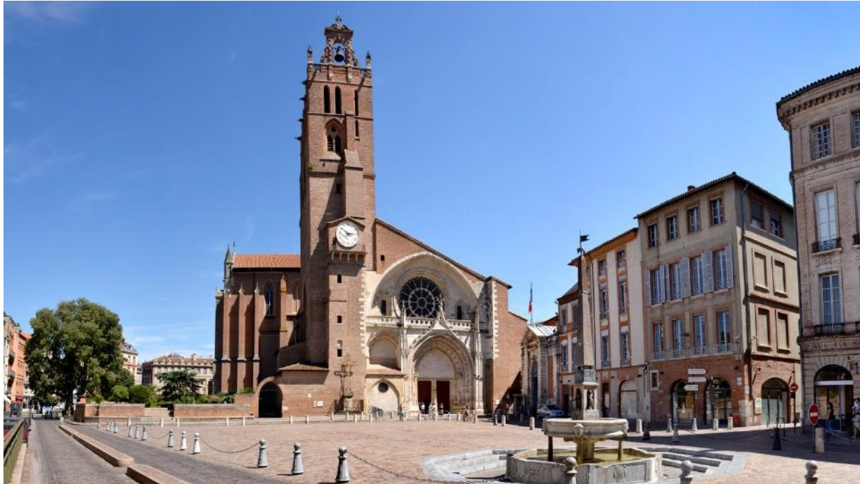
Toulouse, Saint Etienne cathedral