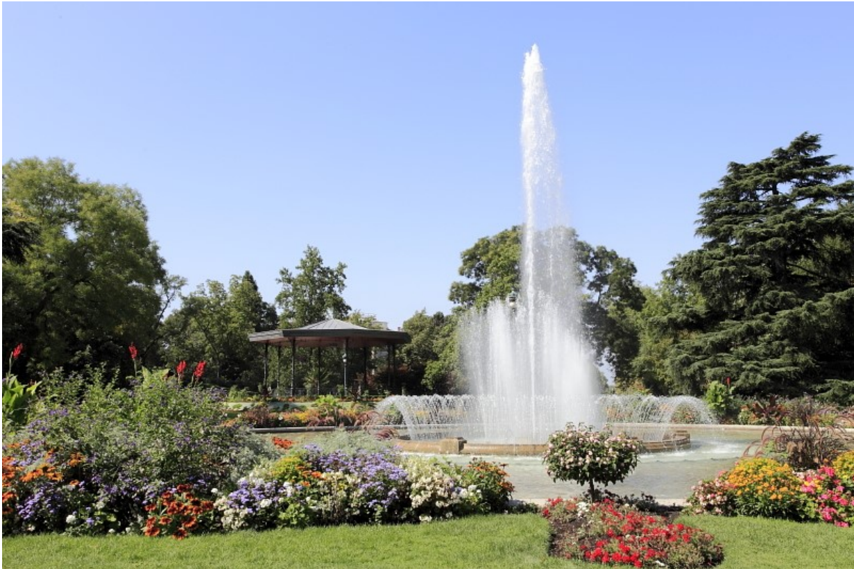
Toulouse, Le grand rond (The big circle)