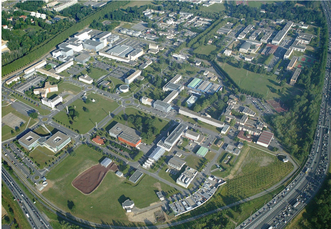
CNES, Toulouse Space Center