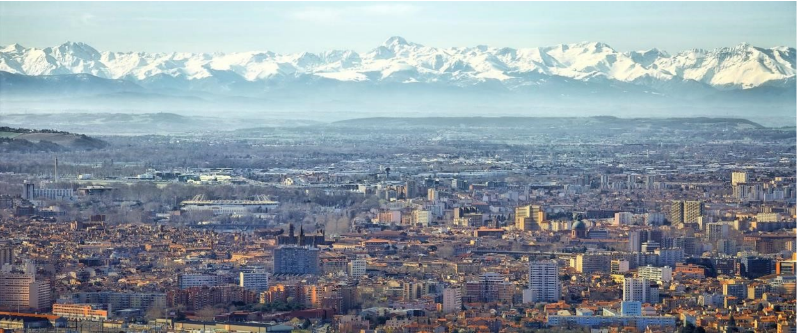
Toulouse, « la ville rose » (The pink city), below the Pyrénées