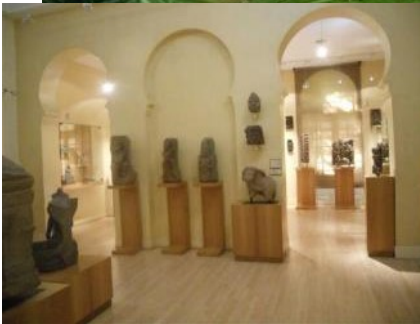
Toulouse, the Labit museum