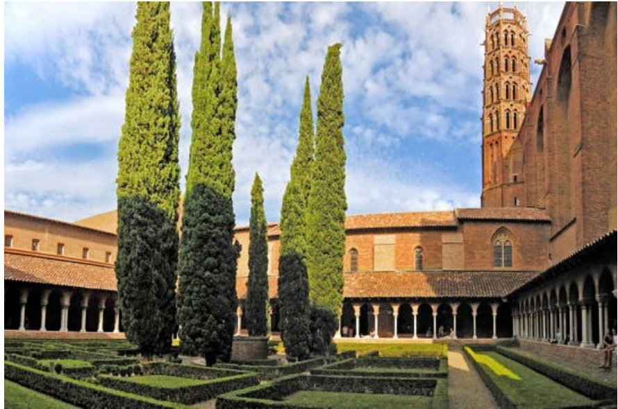
Toulouse, Jacobin Cloyster