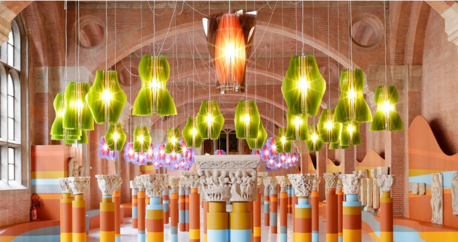
Toulouse, The Jacobin Museum