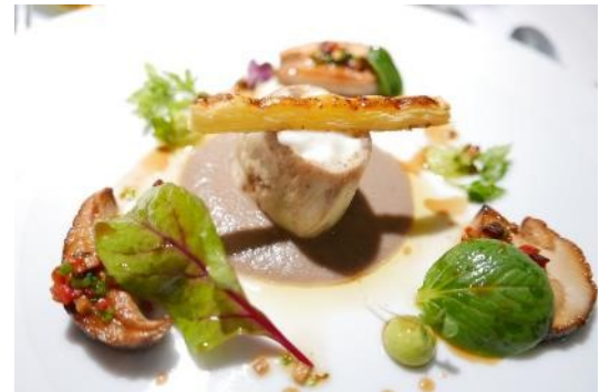
French fine and refined cooking : Restaurants gastronomiques étoilés