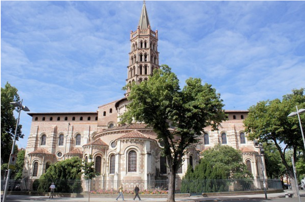
Toulouse, Saint Sernin basilic