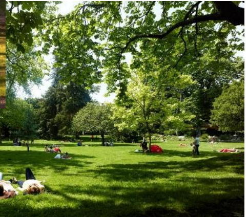
Toulouse, The plants garden