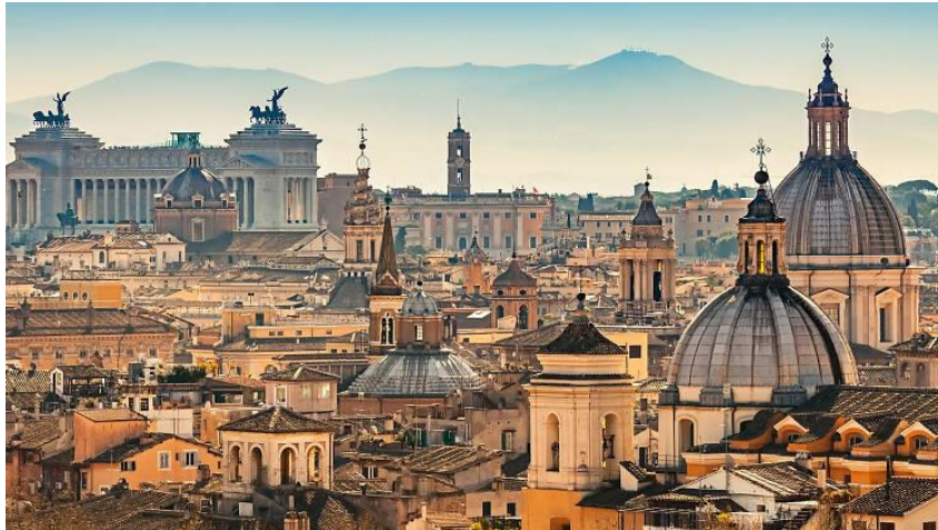
Figure 1. Panoramic view of the Rome's City Center near Piazza Venezia