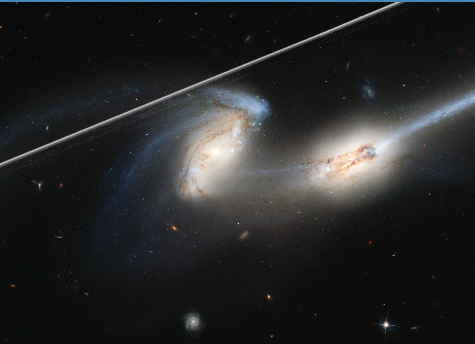
Figure 1: Bright streak left in an astronomical image of a group of galaxies with the Hubble Space Telescope. The streak was generated by a satellite crossing the field of view during the exposure. Courtesy of NASA/STScI [13].

Satellite-induced light and radio pollution affects the night sky globally. This environmental impact means that a pristine night sky is being affected everywhere