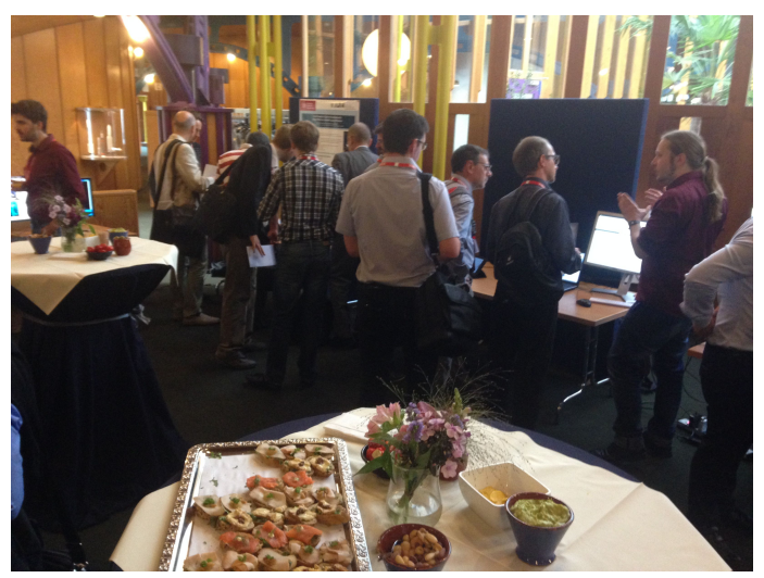
European Space Agency